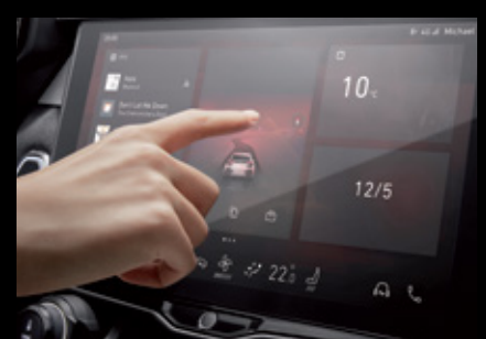
12.7-in. Touchable Center Stack