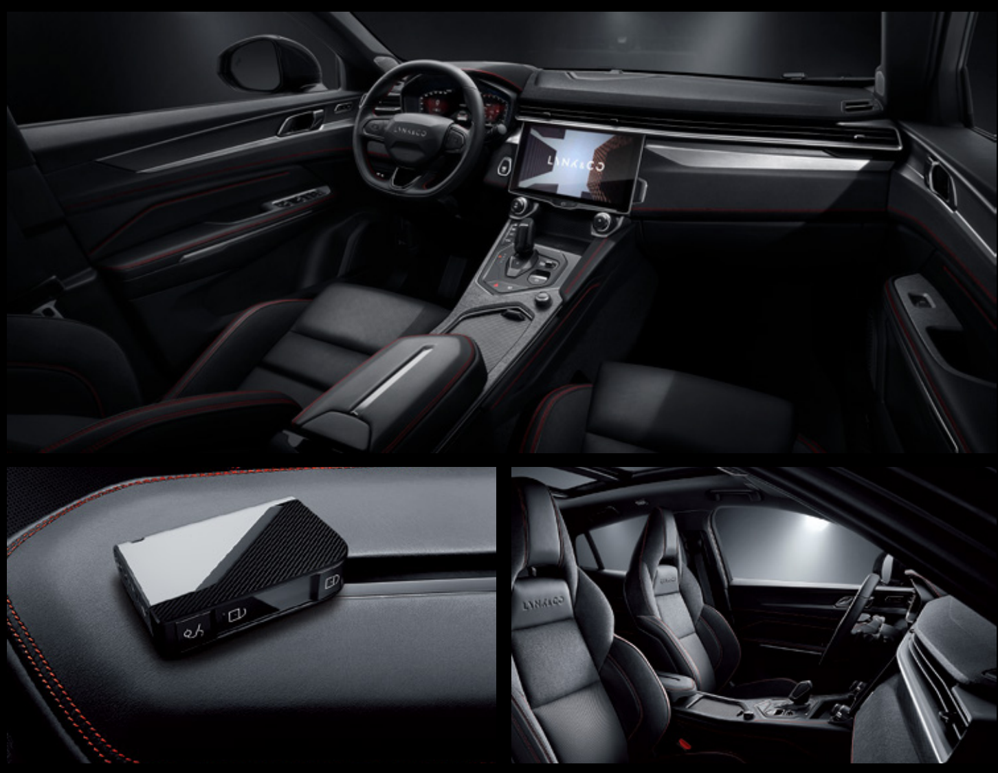
Smart Key Integrated Sporty Premium Seats