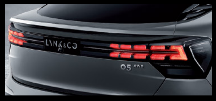
Energy Cube LED Rear Combination Lamps