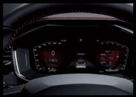
12.3-in. HD Digital Instrument Cluster