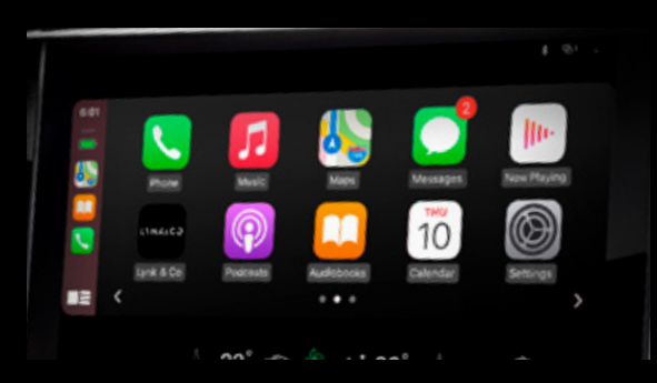
Apple CarPlay & Android Auto