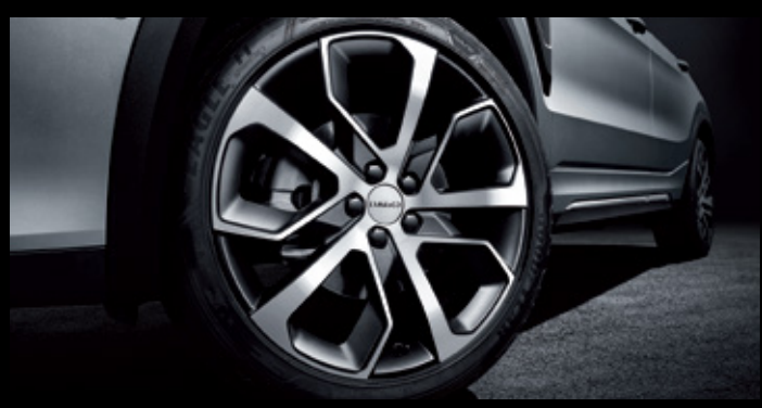
Silver Blade 20-inch Wheel Rim